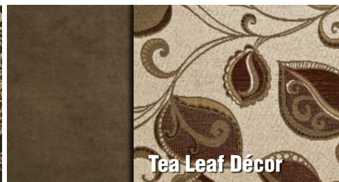
Tea Leaf Décor

For more product details and in-depth information, visit us at www.kz-rv.com |