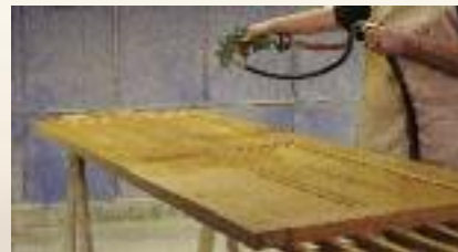
Clear coated natural hardwood doors bring out the luster