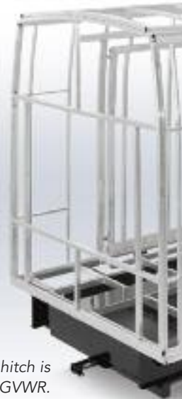
Sidewalls and roof frames are constructed with heavy gauge 1½" x 1½" aluminum tubing.

All slide out walls are welded and laminated within the sidewall to insure that the contour is consistent.