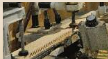
Custom louvered doors