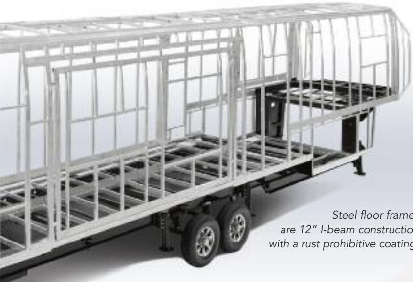
Steel floor frames are 12" I-beam construction with a rust prohibitive coating.