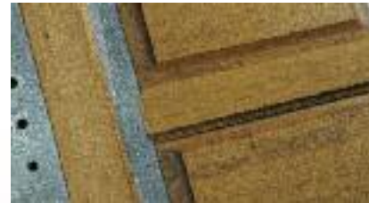
Raised panel door detail