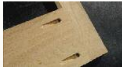
Pocket screws for structural integrity