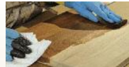
Hand rubbed finishes optimize grain definition