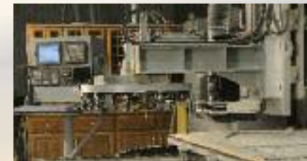
CNC routed custom solid surface countertops