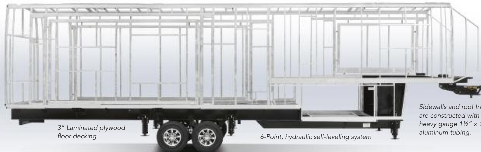
3" Laminated plywood floor decking

Trilogy's construction integrity is durable by design from inside to outside, and in between. And like all Dynamax products, Trilogy is backed up by one of the best warranties in the business.