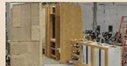
Dividing walls and cabinets are reinforced for added strength