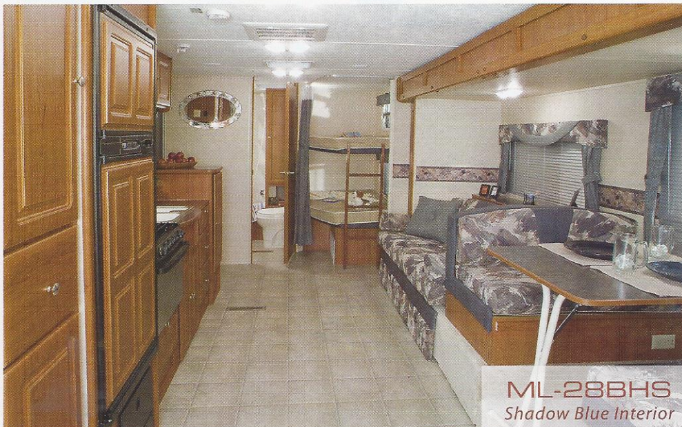
ML-28BHS Shadow Blue Interior