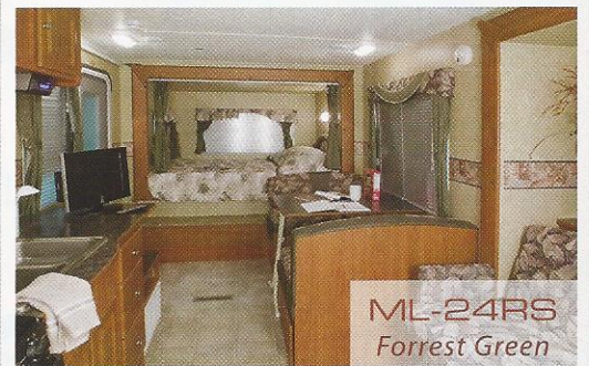
ML-24RS Forrest Green