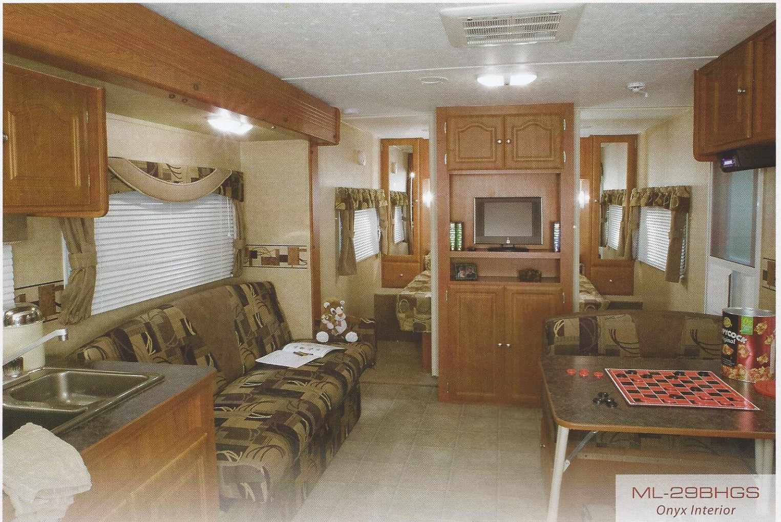
ML-29BHGS Onyx Interior