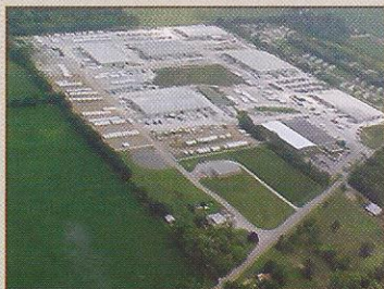
Our 58 acre complex in Warsaw, Indiana

"Quality Features for the Best Value in the Market"