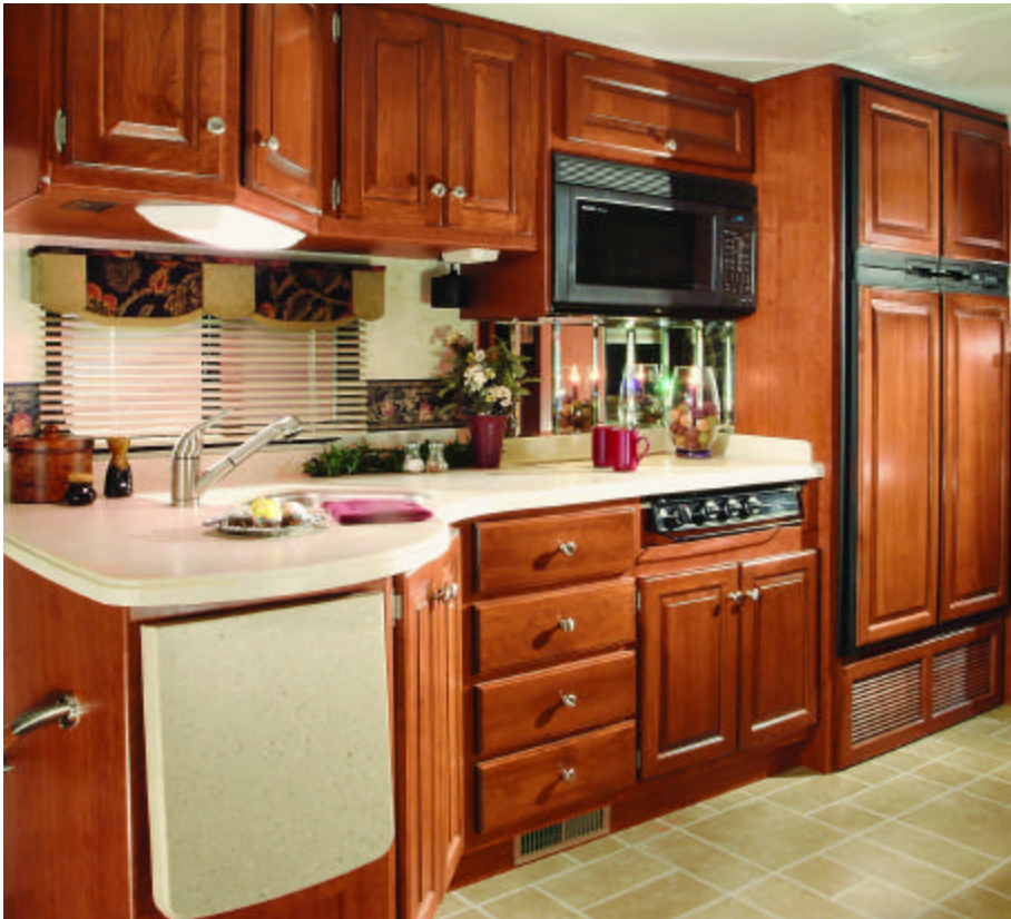
Shown with Hearthstone Raven interior, Wheat carpet, Cherry cabinetry option and optional side-by-side refrigerator with raised panel inserts.

The kitchen is equipped with high-quality appliances such as a spacious 8-cubic-foot refrigerator and 30" convection microwave oven with three-burner gas range top.