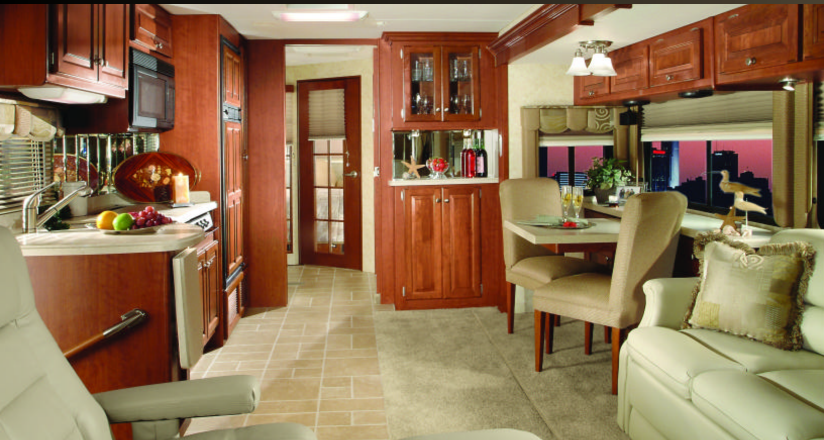
Shown with Santissima Taupe interior, Mushroom carpet, Cherry cabinetry option, and optional UltraLeather™ sofa and Euro recliner with ottoman.

E xtraordinary. That sums up the Infinity Class A motorhome. With exceptional quality.